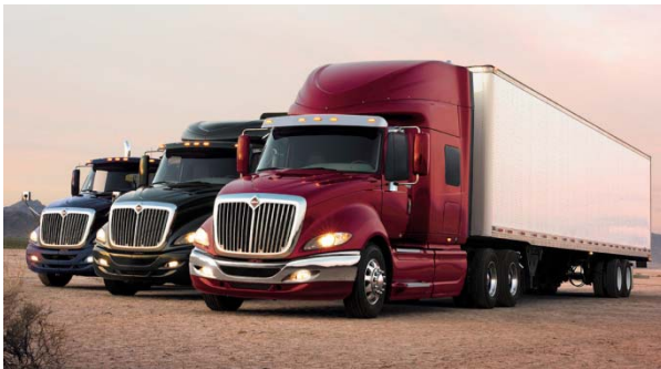
Navistar produces a wide range of trucks

Six Sigma projects rely heavily on statistical metrics to help lead teams to the areas that will benefit the most from process improvements. These "opportunities" are attacked to find the root causes of quality problems.