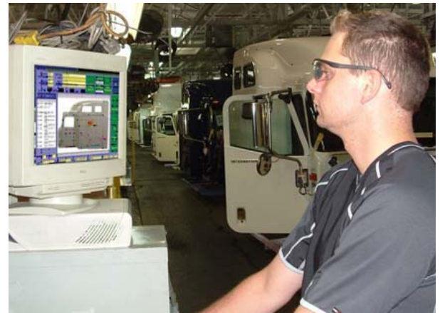
ATS Inspect in use on the Navistar shop floor

“Event Service will allow us to automate the notification process instead of trying to track down the appropriate parties when there is a problem that needs to be addressed immediately,” he adds.