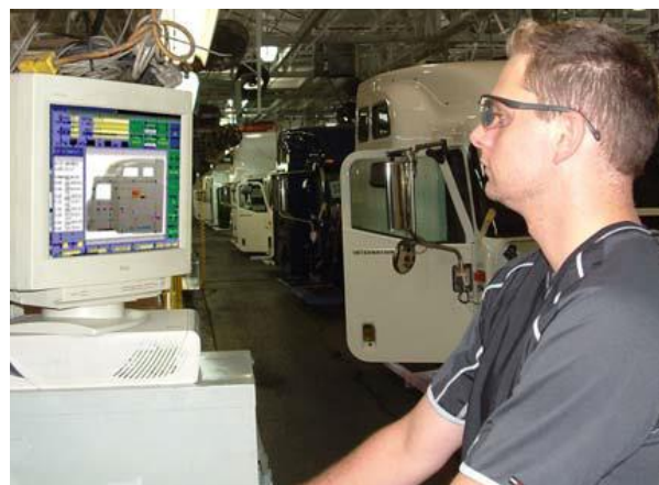
ATS Inspect in use on the Navistar shop floor

“Event Service will allow us to automate the notification process instead of trying to track down the appropriate parties when there is a problem that needs to be addressed immediately,” he adds.