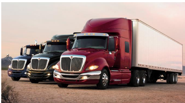
Navistar produces a wide range of trucks

Six Sigma projects rely heavily on statistical metrics to help lead teams to the areas that will benefit the most from process improvements. These "opportunities" are attacked to find the root causes of quality problems.