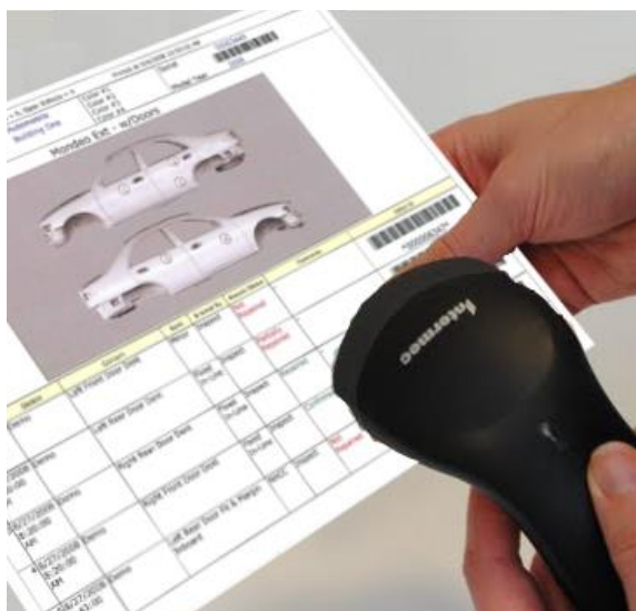
Scanning barcodes to identify defects

No manufacturing process is perfect and when repairs are required it's important that they are carried out completely and efficiently – nothing missed, nothing forgotten. ATS Inspect allows you to do this.