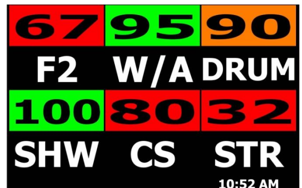
Overhead displays give clear information to the floor

This gives real-time feedback to the point of origin of the quality issues, where the appropriate information can translate into process improvement automatically.