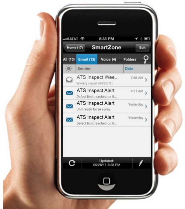
Receive notifications no matter where you are

ATS Inspect can keep them all up to date. From an alert about a single defect to the status of an ongoing quality campaign, the right information will reach the right people right away.